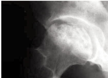
Figure 1. In osteonecrosis of the femoral head the cascade of events leads to collapse of the head and subsequent development of secondary hip osteoarthritis.

LA and aCLA antibodies, as well as antibodies causing false positive tests for syphilis, belong to a family known as antiphospholipid antibodies. They are active against negatively charged phospholipids and have been associated with an increased tendency for thrombot-