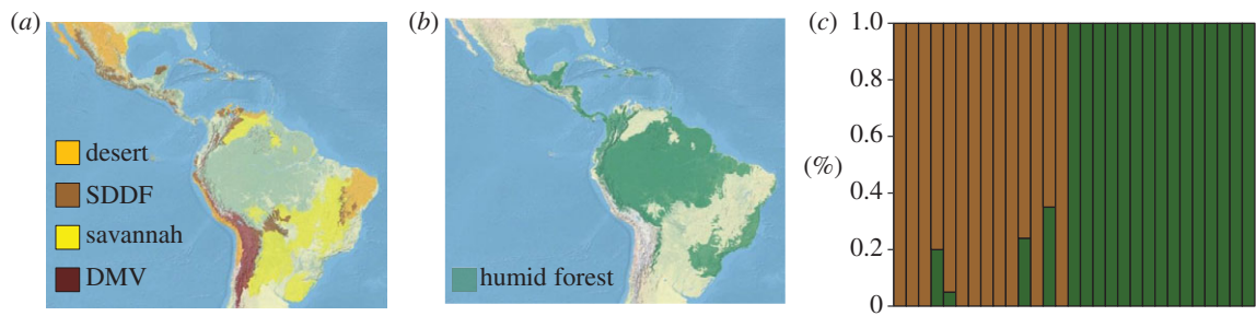
Figure 1. Neotropical biomes and climatic assemblage assignment test. Geographical distribution of (a) dry and (b) humid biomes in the Neotropics. (a) Seasonally deciduous dry forest (SDDF; brown), savannah (yellow), dry montane valley (DMV; maroon), and desert and xeric shrubland (orange). (b) Humid forest (green). Results from climatic assemblage assignment test are shown in (c). Each column represents a species pair (in alphabetical order; see the electronic supplementary material) and the colour indicates the proportion of climatic data ( y -axis) from each pair ( x -axis) that is assigned to the dry (brown) and humid (green) groups.

corridors for dry habitat species are formed and humid habitat populations became isolated. Surprisingly, given the intensive interest in understanding the role of climate change on speciation in the tropics, there have been few studies on the diversification of dry habitat taxa and even less on comparative studies between humid and dry habitat taxa [20].