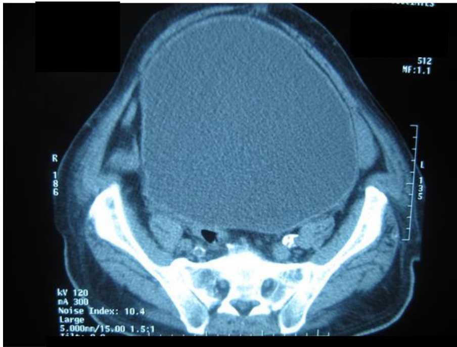
Figure 2 Computed tomography scan of the abdomen showing a distended urinary bladder. Computed tomography image of the abdomen found a grossly distended urinary bladder extending out of the pelvis.