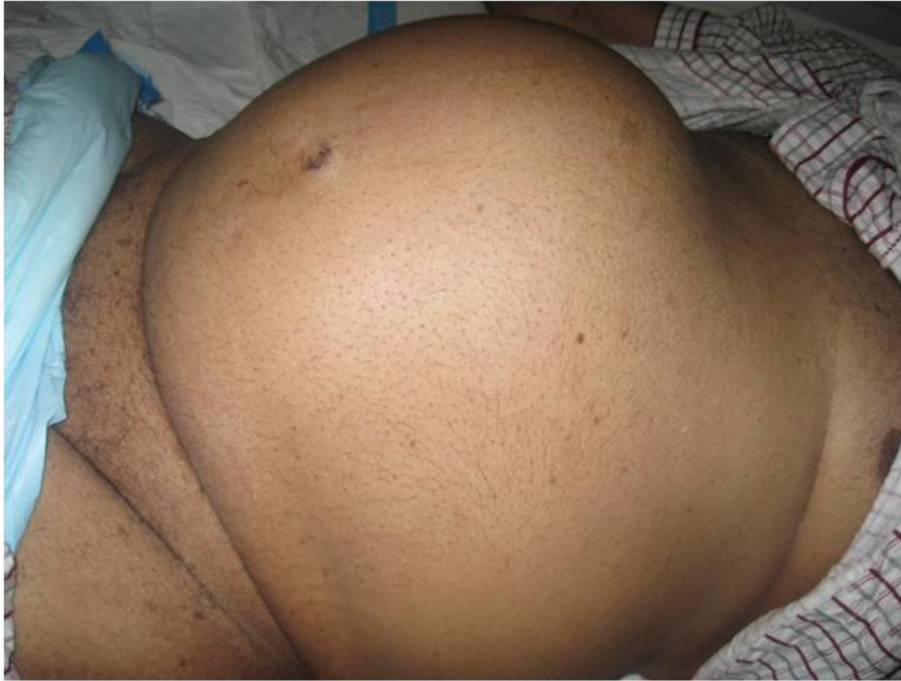
Figure 1 Large abdominal mass extending to the epigastric region. The photograph shows the large abdominal mass found on general inspection of the abdomen. It arose out of the pelvis and was felt up to 4 cm below the xiphisternum.