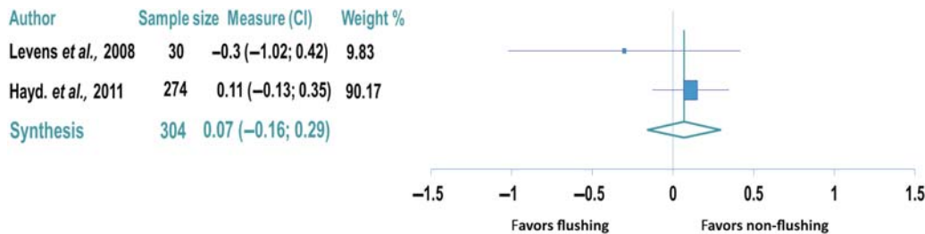
Figure 3 Forest plot comparing the number of oocytes retrieved in the flushing and non-flushing groups. Data reported per patient.

et al. (2009) reported ongoing pregnancies in 40% of the non-flushing group and 20% of the flushing group ( P = 0.19 ). Haydardedeoglu et al. (2011) reported live birth in 39.4% of the non-flushing group and 38.1% of the flushing group ( P = 0.68 ). Statistical synthesis of pregnancy outcomes was not performed given the heterogeneity of the outcomes reported in the primary studies.