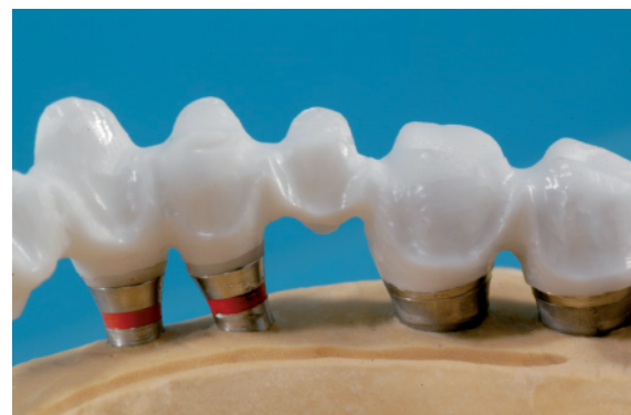
Figure 3 Detail of the structure of zirconia in a full arch: the connectors after finishing. This is needed to ensure spaces for adequate oral hygiene of the prosthesis, to protect the periodontium and / or the peri-implant tissue.

From all these studies is clear how the connector is the critical factor of the whole restoration and that it should be not less than 6.25 mm 2 or more. This is valid for 3-unit posterior bridges. In the case of bridges of 4 elements it must surely be greater than 7 mm 2 (9 mm 2 , or better 16 mm 2 ). This is valid in the case of normal chewing activities while in the case of parafunctions is more appropriate to use the classic metal-ceramic rehabilitation.