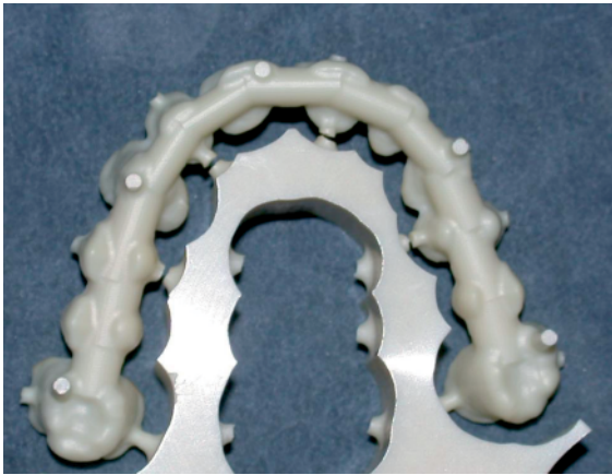
Figure 2 The framework just out of phase CAM. At this stage the diameter of the connectors is oversized to allow the technician to work it in the finishing stages, obtaining a wide margin of safety.

If the prosthesis replaces two teeth instead of one, the connector should be larger than the above and still be more than 7 mm 2 .