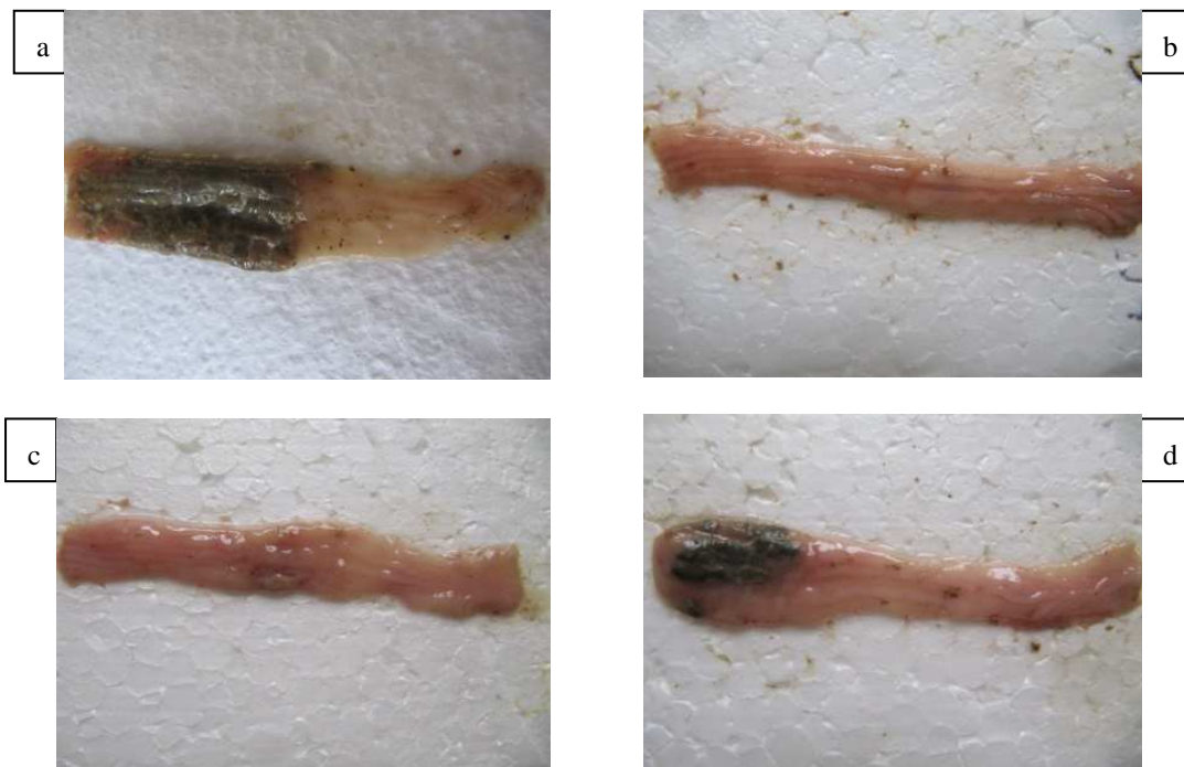
Figure 1. Macroscopic presentation of TNBS-induced colitis in rats. A: Negative control. B: Prednisolone (4 mg/Kg, p.o.) treated colitis. C: Kojic acid (300 mg/Kg, p.o.) treated colitis. D: Maltol (280mg/Kg) treated colitis. All treatments were made 2 h prior colitis induction and continued for 5 days later.

Maltol at the greatest dose (280 mg/kg) was effective to reduced total colitis index ( P < 0.01 ) as well as crypt damage score. Similar to macroscopic results, kojic acid vitamin E, and lowest dose of maltol (70 mg/kg) could not alleviate the histological features of colitis in test groups [Figures 2d, 2e and Table 2].