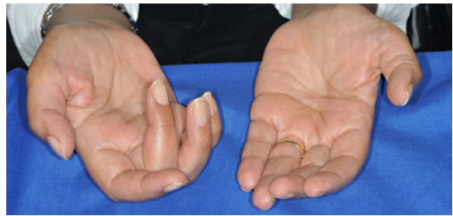
Fig. 1 Atrophy of thenar eminence and weakness of finger extensors, more prominent on the right, in a 70-years-old woman with symptoms of ALS for 6 months

Although the sequence of emerging symptoms and the rate of disease progression are variable, most patients will