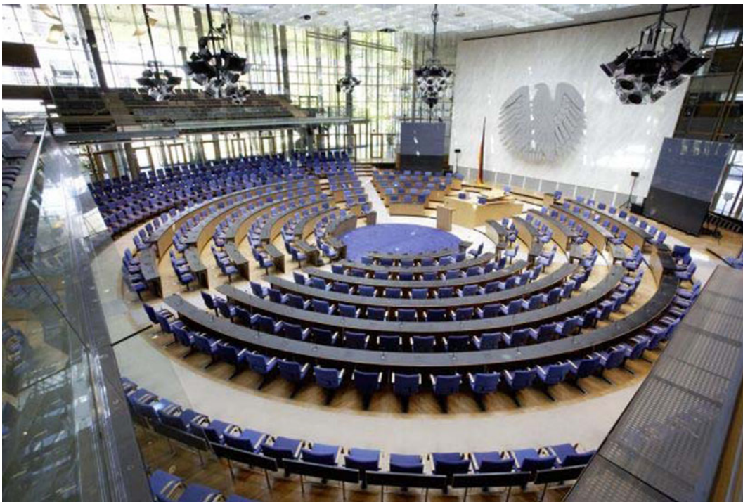
Congress venue: Former Parliament of Federal Republic of Germany – BUNDESTAG Platz der Vereinten Nationen 2, 53113 Bonn

congresses, on September 15th till 18th 2011, representatives and delegations from more than 40 countries worldwide are coming together in Bonn, Germany, in order to summarise current achievements, discuss problems, create future strategies and celebrate our consolidation in the innovative field of preventive, predictive and personalised medicine.