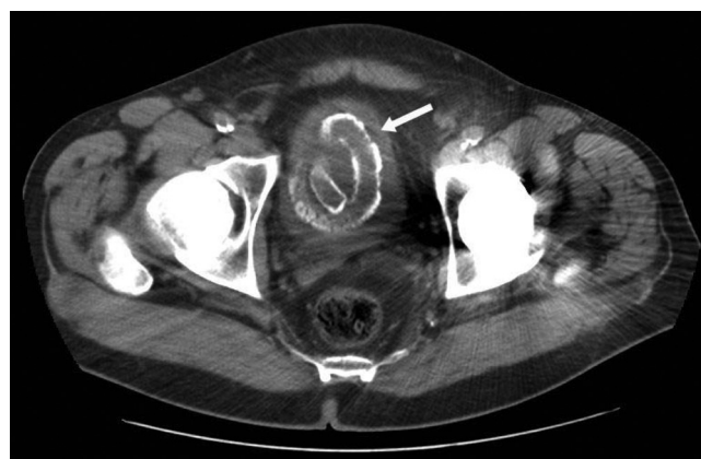
FIG 1 CT scan of the pelvis, demonstrating a large spiral-shaped tubular calculus within the urinary bladder (arrow).

On cut sectioning, the specimen revealed a gelatinous cut surface from which a minute amount of clear fluid could be expressed. Microscopic examination of touch preparations obtained from the cut surface and the expressed fluid revealed occasional