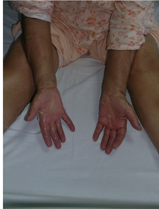
FIGURE 3: Erythema of the palms with generalized exfoliative desquamation.

Retinoids, the natural and synthetic derivatives of vitamin A, exert their effects by modulating the transcription of genes critical to cellular differentiation by binding to nuclear RAR [2]. ATRA acts on RAR and induces differentiation and apoptosis in both normal and malignant promyelocytes [3, 4]. Side effects of ATRA are dose related and mostly involve the skin and mucous membranes. Dermatologic complications consist of skin/mucous membrane dryness (77%), rash (54%), pruritus (20%), alopecia (14%), and skin changes (14%). Most patients complain of dryness and at higher doses, erythema of the skin, mouth, eyes, and lips. A few cases of scrotum exfoliative dermatitis with ulcers associated with ATRA treatment have been described [2, 5, 6]. In most of these cases, the toxicities were noted in