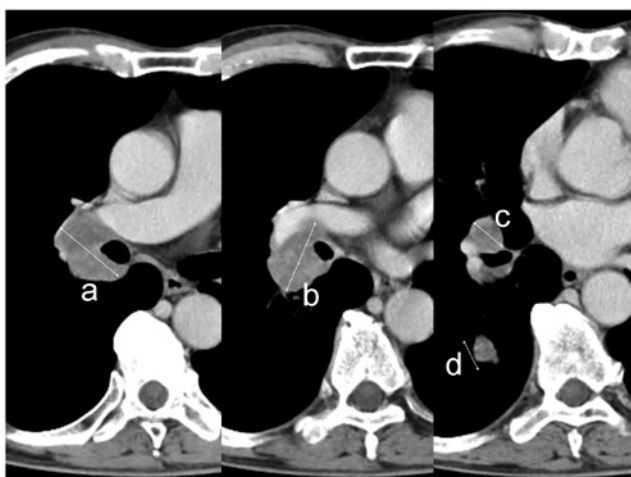
Figure 1. Sample showing the manner in which tumor volume was calculated. Long axis distances were measured for the respective nodules, without distinguishing the primary lesion from lymph node metastasis. Tumor volume was defined as the sum of the long axis distance of each CT slice at a 1-cm interval (i.e., tumor volume = a+b+c+d).

lesions were observed on the initial chest X-ray. The time to progression was calculated from the last day of radiotherapy to the date of the first evidence of disease progression. The intervals between subsequent follow-up examination using CT imaging of the chest and abdomen or brain MRI were variable. When the level of any tumor marker became elevated, further examination was performed immediately, in addition to the routine follow-up examination occurring every 1-3 months. If concurrent loco-regional failure and distant metastasis were observed, they were classified as distant metastasis. Using the Kaplan-Meier method, survival time was measured from the date of administration of any initial treatment to the date of death from any cause. The log-rank test was used to evaluate any difference. Statistical analysis was carried out using SPSS version 16.0 software (SPSS Inc., Chicago, IL, USA).