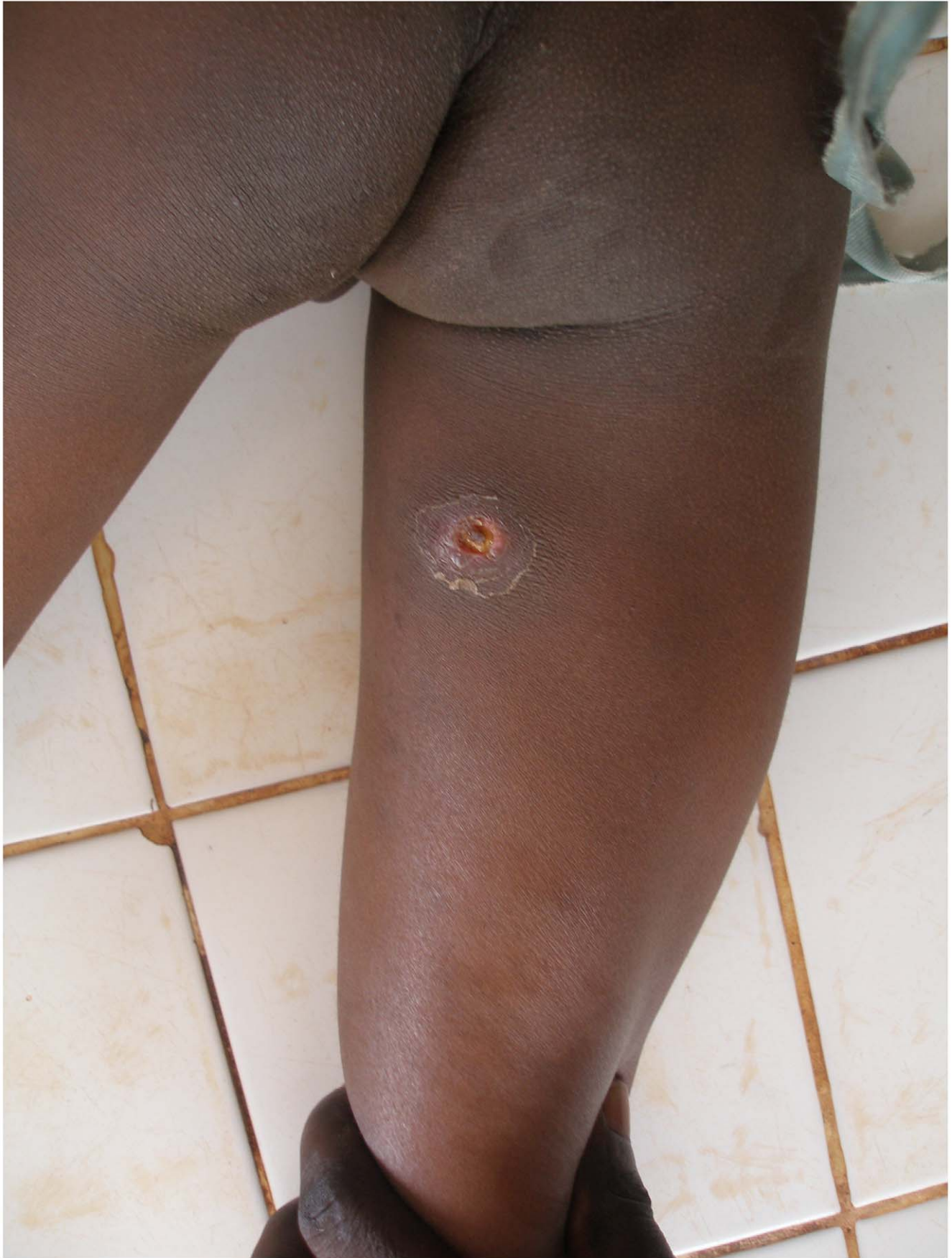
Figure 3. Secondary ulcerated nodule at the back of the right thigh, July 2011. doi:10.1371/journal.pntd.0001747.g003