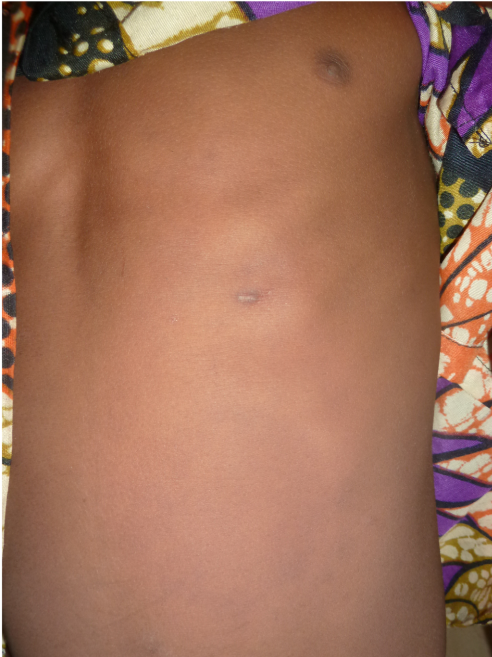
Figure 2. Scar of the primary nodule at the left costal arch, September 2010. doi:10.1371/journal.pntd.0001747.g002

clinically suspected BUD cases, Gordon et al. recently reported the first case of spontaneous resolution of a laboratory confirmed BUD ulcer in a patient from Australia [9]. Whereas the secondary lesions of the two BUD patients from Benin were surgically excised, the ulcerated lesion of the Togolese case also healed under conventional wound care.