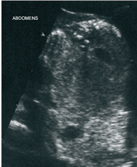
Figure 4. Transverse section showing two stomachs and common liver; Case 1.