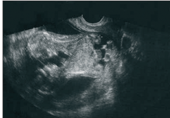
Figure 1. Sagittal section showing thoraco-omphalopagus twins; Case 1.

While we served on a humanitarian mission to Gujarat, India, a patient came to the emergency department of Bharush Hospital at around 35 weeks GA. She presented with violent uterine contractions caused by polyhydramnios. Sonography performed with rudimentary equipment and poor resolution confirmed polyhydramnios and a fetus lodged in the posterior uterus, seeming to consist of a sole cephalic pole and four extremities ( cephalothoraco-pagus ). Unfortunately, images could not be preserved. The fetus was delivered vaginally without dystocia and proved to be conjoined twins with no cardiac activity (Fig. 5). Autopsy was declined by the mother.