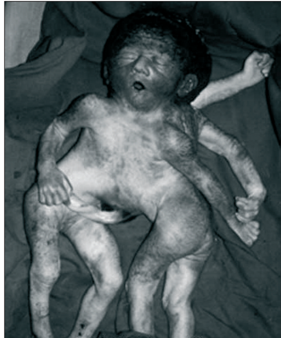
Figure 5. Cephalothoracopagus twins at birth of Case 2.

utero (5). Approximately six to ten cases of conjoined twins per annum worldwide are treated surgically. The surgery is most successful.