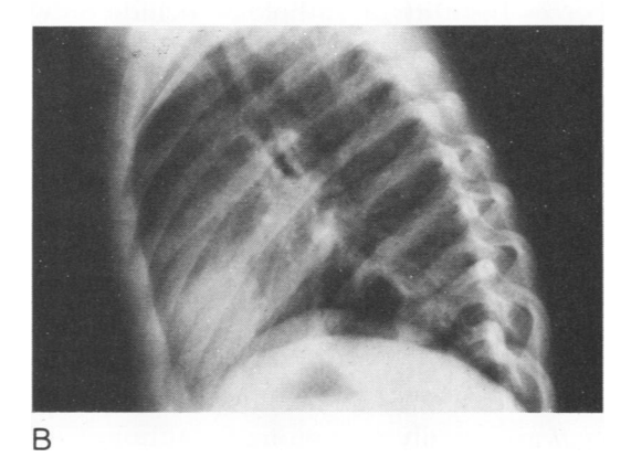
Fig. 1 Frontal (A) and lateral (B) chest X rays showing the bulge along the left heart border.

From the E.C. Lambert Department of Cardiology and the Department of Radiology, Children's Hospital of Buffalo, Buffalo, New York.