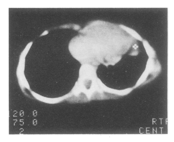
Fig. 2 Computed tomography scan of the chest showing the lesion on the left side of the heart, anteriorly.

The differential diagnosis of pericardial cysts includes teratoid cysts and tumors, lymphomas, thymic lesions (including thymic