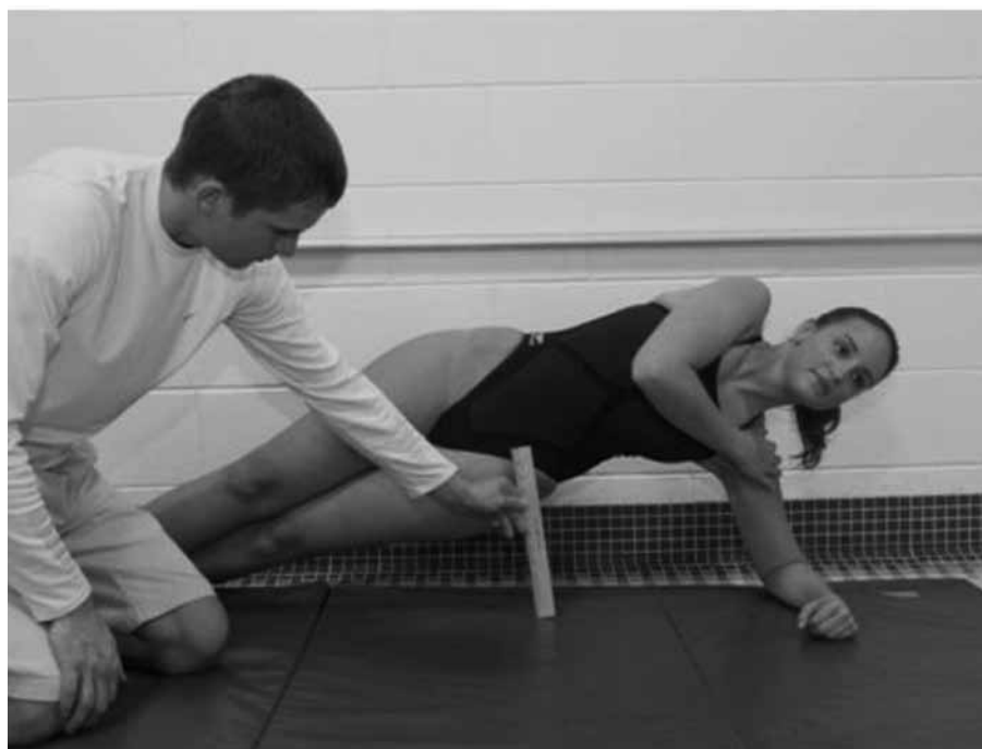
Figure 1. Timing for the side bridge test begins with the participant lying on her side on 1 elbow and both feet with the top foot in front and ends when her hips drop.

Station 5: Pectoralis Minor Length. Pectoralis minor length was measured with a PALM palpation meter (Performance Attainment Associates, St Paul, MN) using surface landmarks validated by Borstad 18 (Figure 2). The following landmarks were palpated and marked by the first author (A.T.): the inferior aspect of the sternal notch and the lateral aspect of the acromioclavicular joint, which represented the clavicle length; and the medioinferior aspect of the coracoid in the deltopectoral groove, which is the proximal pectoralis minor attachment. Next, the anteroinferior aspect of rib 4 one finger-width lateral to the sternum was identified, and the swimmer was instructed to hold her index finger on the spot while the investigator measured the distance from rib 4 to the coracoid process, which represented the pectoralis minor length at rest. Next, the swimmer was instructed to elevate her upper extremity to shoulder level and flex her elbow to 90° while placing her forearm on the doorjamb. She then was instructed to twist her trunk away from her upper extremity without moving her feet until she felt a strong stretch in her pectoral muscle. A second measurement from the coracoid to rib 4 was taken and represented the length of the pectoralis minor on stretch (Figure 2). 19 Normalized pectoralis minor length at rest and on stretch was obtained by dividing the pectoral length under each condition by the clavicle length.