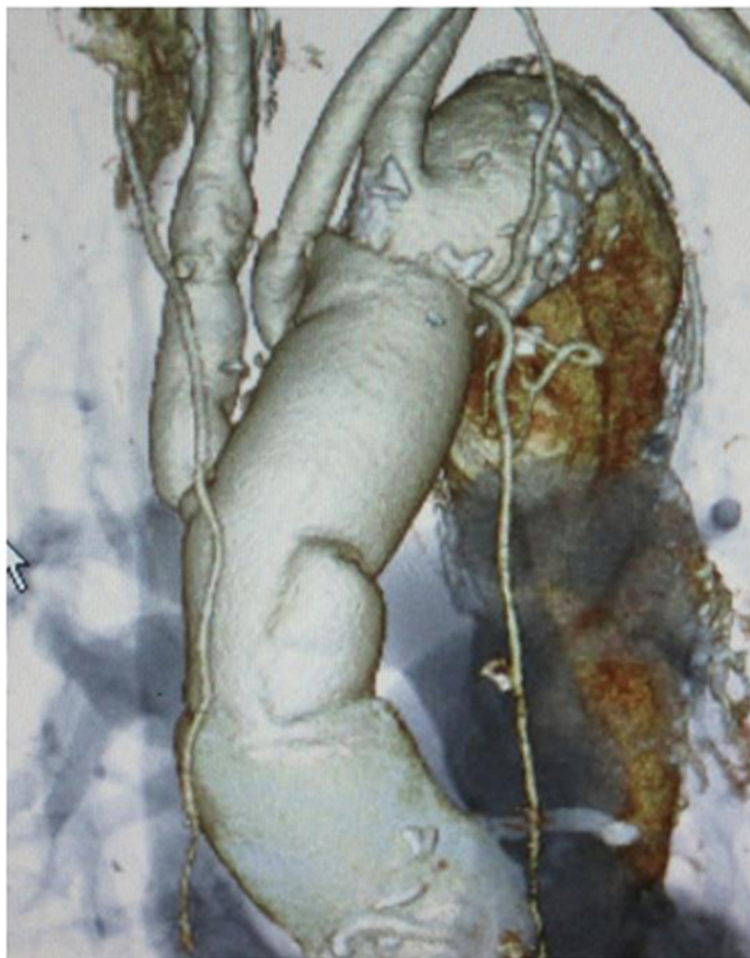
Figure 4 Postoperative 3-dimension computed tomography. There is no stenosis or dilatation of the branches.

detected. It may have been due to the long preoperative period of intravenous antibiotic therapy. The type of pathogen also affects the prognosis. A case who showed the colonized and damaged inner layer of the equine pericardial roll graft by methicillin-resistant Staphylococcus aureus was reported [7].