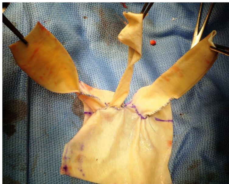
Figure 2 Three-branched pericardial sheet. Three holes, having a diameter of 10 mm, 10 mm, and 15 mm, respectively, were made. The holes were made 5 mm apart, and the last hole was made 20 mm from the edge of the sheet. Three rectangular sheets were cut from another pericardial sheet, and each of them was sutured to the circumference of a hole in the pericardial sheet and formed into a cylinder by continuous suturing with 5-0 polypropylene.

second middle branch was not used to reconstruct a vessel because native subclavian artery could be preserved, but it was used as an inflow root of the cardiopulmonary bypass. The main roll graft was clamped, antegrade perfusion was restored from the middle branch (Figure 3-B). While warming, the first proximal branch was anastomosed to the brachiocephalic artery. After completing the proximal anastomosis, the aorta was de-clamped (Figure 3-C). The aortic cross clamp time was 120 min,