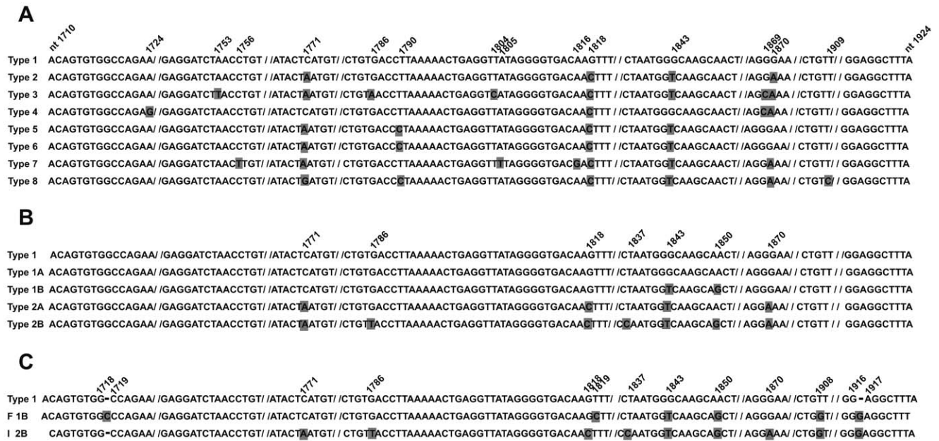
Figure 1. Alignment of JCV VP1 sequences, nt 1710–1924, from fertile (F) and infertile (I) subjects. Panel A. The most representative JCV genotype strains, types 1–8 are indicated. Nucleotide substitutions in JCV strains are numbered and marked in grey. Panel B. JCV 1 and 2 strains and related subtypes 1A and 1B, and 2A and 2B are indicated. Nucleotide substitutions are numbered and marked in grey. Panel C. VP1 coding sequences of JCV 1B and 2B strains identified in semen and urine samples from fertile (F) and infertile (I) subjects, respectively, compared to JCV 1 strain (upper line). Nucleotide substitutions and insertions are numbered and marked in grey. The sequence homology of JCV genotypes was compared with the Blastn using flat master-slave with identities of the National Centre for Biotechnology Information (NCBI). Sequences used for the analysis include on Panel A: Mad-1 strain of JCV type 1 [GenBank, accession no.J02227]; MY strain of JCV type 2 [GenBank, accession no.AB038250]; #308 of JCV type 3 [GenBank, accession no.U73500]; #402 of JCV type 4 [GenBank, accession no.AF015528]; #501 of JCV type 5 [GenBank, accession no.AF015684*]; #601 of JCV type 6 [GenBank, accession no. AF015537]; #701 of JCV type 7 [GenBank, accession no. AF295737]; #801 of JCV type 8 [GenBank, accession no. AF281623]. Panel B: Mad-1 strain of JCV type 1; #124 of JCV type 1A [GenBank, accession no. AF015526]; #123 of JCV type 1B [GenBank, accession no. AF015527]; #226 of JCV type 2A [GenBank, accession no. AF015531]; #223 of JCV type 2B [GenBank, accession no. AF015532]. Record removed. This record was removed at the submitter's request because the sequence cannot be confirmed. doi:10.1371/journal.pone.0042880.g001