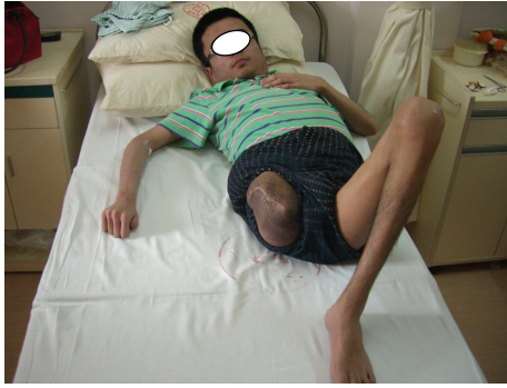
FIGURE 5: Ten months after operation patient's overall health condition improved significantly.

intraosseous pressure may cause osteolytic bone destruction and the swelling damage. In some instances, the extreme swelling led to the breakthrough of the cortical bone. The pseudotumor often associated with soft tissue swelling and periosteal reaction. The hyperplasia of the periosteum may risk further damage. The pseudotumor occurred in the long bones can easily cause pathological bone fractures, which easily get misdiagnosed as the bone tumor if patient's clinical history of easy bleeding was neglected. Hemophilic pseudotumor has X-ray characteristics of both benign and malignant bone tumors, such as bone destruction, periosteal reaction, and new bone formation [4–7]. Therefore, once the patient is admitted, the doctor should check details of the patient clinical history and combine then with other checkup data to make the correct diagnosis.