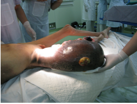
FIGURE 1: Inflammatory pseudotumor of the right lower limb.