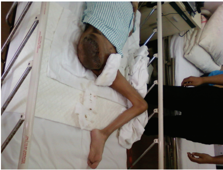
FIGURE 2: 3 weeks after amputation, the cross-section wound first degree heal.

range. The heart failure and kidney failures occurred during the conservative treatment which required symptomatic treatment and intensive care.