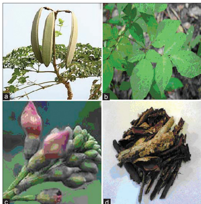
Fig. 1: Oroxylum indicum : (a) tree (b) leaves (c) flowers (d) wood bark

Roots are sweet, astringent, bitter, acrid, refrigerant [9] , antiinflammatory, anodyne, aphrodisiac, expectorant, appetizer, carminative, digestive, anthelmintic, constipating, diaphoretic, diuretic, antiarthritic, antidiabetic and febrifuges. Tonic is useful in dropsy, cough, sprains neuralgia, hiccough, asthma, bronchitis, anorexia, dyspepsia, flatulence, colic, diarrhea, dysentery, strangury, gout, vomiting, leucoderma, wounds, rheumatoid arthritis and fever. Root bark is used in stomatitis, nasopharyngeal cancer and tuberculosis [4,10] . Leaves are used as stomachic, carminative and flatulent. Leaf decoction is given in treating rheumatic pain, enlarged spleen [4] , ulcer, cough, and bronchitis. Mature Fruits are acrid, sweet, anthelmintic, and stomachic. They are useful in pharyngodynia, cardiac disorders, gastropathy, bronchitis, haemorrhoids, cough, piles, jaundice, dyspepsia, smallpox, leucoderma and cholera [3] . Seeds are used as purgative. Dried seed powder is used by women to induce conception. Seeds yield non-drying oil used in perfume industry. The seeds are ground with fire soot and the paste is applied to the neck for quick relief of tonsil pain. The seeds are used in