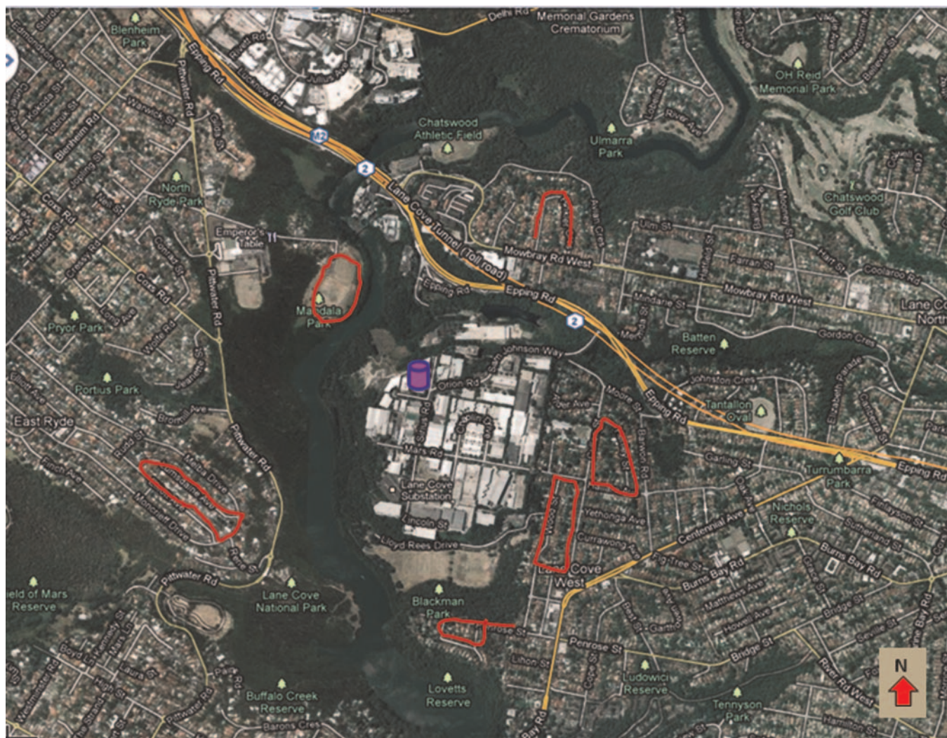
Figure 2 Study area and field sites.

For each study day, two of the six stack sites were selected and defined as ‘upwind’ or ‘downwind’ sites based on the wind direction recorded at 06:00 that morning.