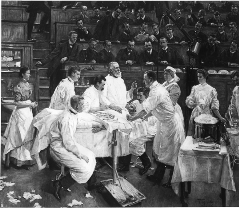
Figure 2: The local culture of asepsis at Ernst von Bergmann's hospital in Berlin. Painting of 1906 by Franz Skarbina (1849–1910), painting missing since 1945.

The practices that Schimmelbusch subsumed under the heading 'asepsis' were adopted simultaneously in different places in the German-speaking world. Standardisation was supported by the use of the same devices, such as the Schimmelbusch drum, and by using the same textbooks, such as his Guide . The urge with which Schimmelbusch, and other elite surgeons, asked their colleagues to adopt aseptic principles is an indirect indicator of resistance or at least inertia in the surgical profession. In any case, the individual surgical centres differed considerably in their techniques – gloves and masks, for example, were used in some places but not in others. One can speak of veritable local cultures of asepsis. A painting of 1906 by Franz Skarbina (1849–1910) (Figure 2) shows how Bergmann's clinic represents one such local culture.