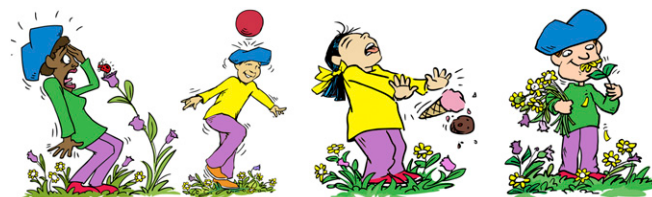
Fig. 3. Sample Illustrations.

Given the pernicious consequences of social essentialism, elucidating the processes underlying its development is a critical goal. Indeed, in study 3, parents who were induced to hold essentialist beliefs about Zarpies were more likely to produce negative evaluative statements about them. Thus, these data suggest that inducing essentialism may contribute to negative social attitudes (13, 16, 38–40). Understanding the mechanisms that underlie the development of social essentialism could provide guidance on how to disrupt these processes, and thus perhaps on how to