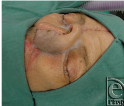
Figure 5. Flap inset prior to division.