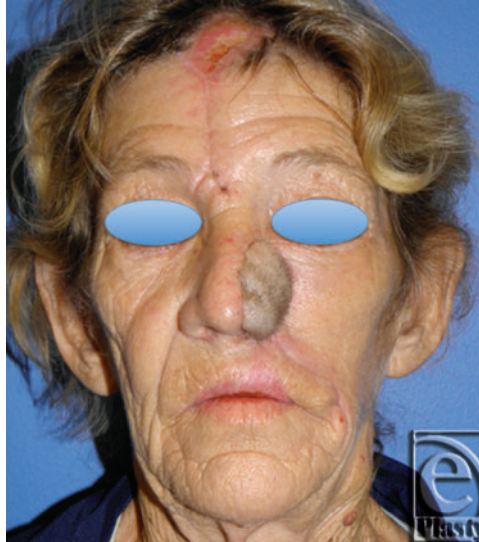
Figure 7. Postoperative photo, inset, and healed flap (Frontal).

with PFFs, the delay phase in these reconstructions not only leads to discomfort and temporary inconvenience but can also cause joint contracture.