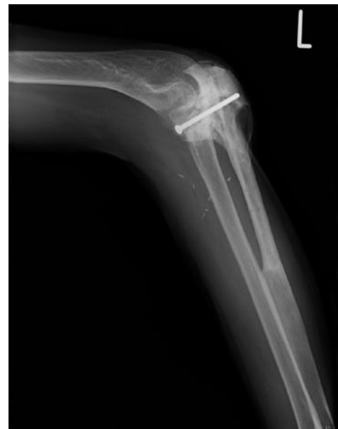
Figure 3. Radiographs taken 10 years after the surgery.