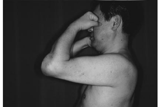
Figure 4. Images of the upper limb with (A) extension and (B) flexion.

pronation, 80; supination 10) (Fig. 4). The patient is able to play golf with no lateral instability or pain of the elbow joint.