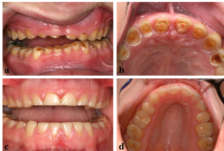
Figure 1 Tooth wear in PWS. (a, b) Extreme tooth wear with pulp exposure in 6 teeth in a 36-year-old male, (c, d) Typical tooth wear in a 28-year-old female.

individuals in the study group ( n = 2 > 18 years, n = 1 < 18 years).