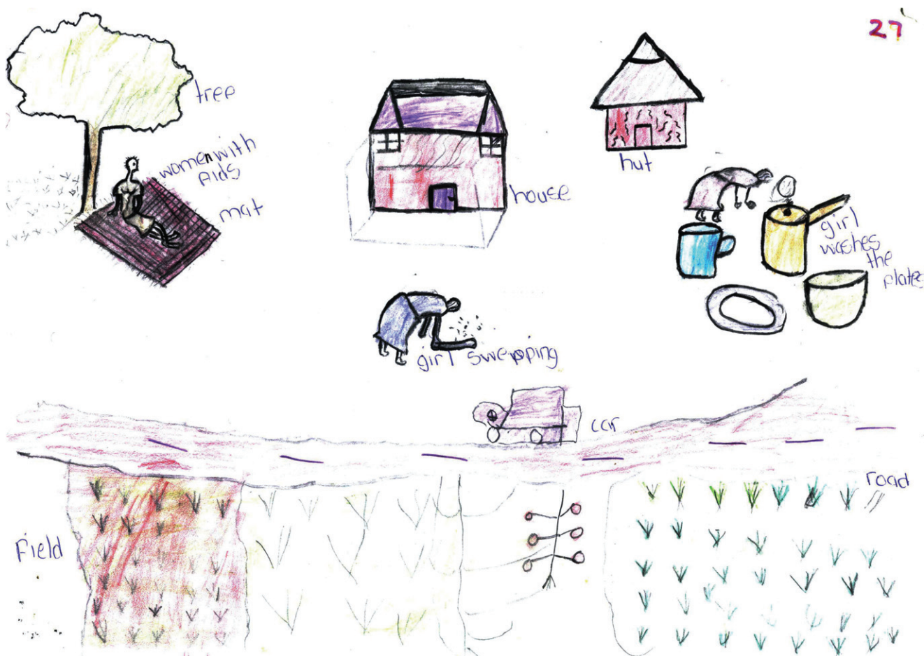
Figure 3. Two AIDS-affected siblings busy with domestic chores.

However, more AIDS-affected children (73%) than poverty-affected children (39%) were represented engaging in work, domestic chores and caregiving ( P = 0.007 ). In accounts of AIDS-affected children, caregiving featured more prominently, and as an added responsibility to income generation, underlining AIDS-affected children as active contributors to their household.