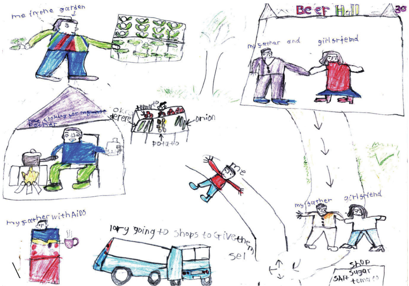
Figure 2. Drawing by an 11-year-old girl showing (clockwise from top right) the father of an AIDS-affected boy meeting a girlfriend in a beer hall and eventually contracting AIDS, leaving the boy to do the cooking and income generation.

sell clothes and shoes. (urban girl, 12, describing poverty-affected girl)