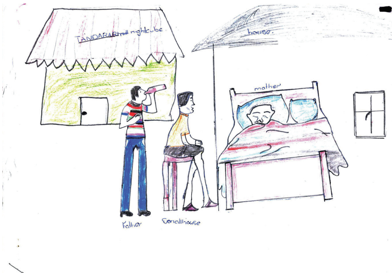
Figure 1. Drawing by a boy, 12, showing the father of an AIDS-affected boy outside a nightclub, watching his bedridden wife.