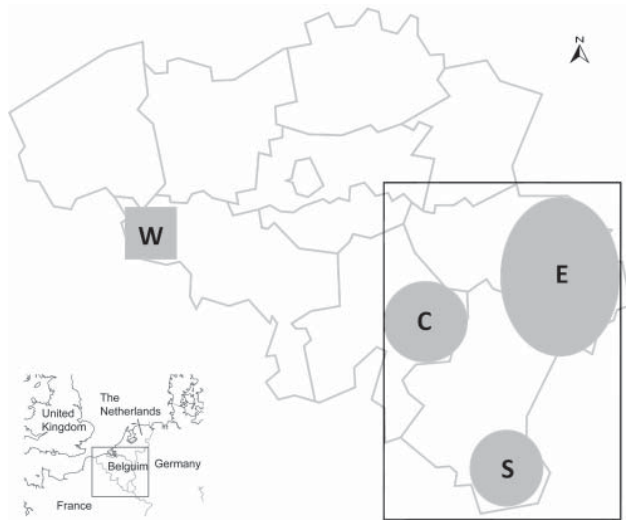
Figure 1. Location of 209 farms in Belgium from which 519 pairs of cow/calf serum samples were obtained from blood drawn by field veterinarians in southeastern (rectangle, 195 farms) or southwestern (square, 14 farms) areas in 2012. The area represented by the rectangle is centered on the village of Béthomont (50°08'N, 5°65'E) and measures ≈150 km from north to south and 100 km from east to west. Areas C (center), E (east), and S (south) refer to 3 distinct spatial clusters within the area represented by the rectangle. The area represented by the small shaded square (W) is centered on the village of Taintignies (50°54'N, 3°34'E); each side measures ≈20 km.

they received colostrum and farm location ( p = 0.639 ), with 23.8%, 23.0%, 31.6%, and 25.3% seroprevalence in eastern, southern, western, and central areas, respectively (Figure 1). Infection of pregnant cows by Schmallenberg virus thus often results in transmission to the fetus across the placenta, and this transmission does not lead automatically to abortion, stillbirth, or congenital deformities. Because none of the calves examined here showed the neurologic or musculoskeletal signs typically associated with unrestricted replication of Schmallenberg virus (3,4), maternal infection probably occurred after the fetuses became immunocompetent, that is, after the 150th day of gestation (7). Therefore, on the basis of the corresponding dates of artificial inseminations, we conclude that the 38 seropositive calves born during March 19–April 22, 2012, were infected after November 1, 2011.