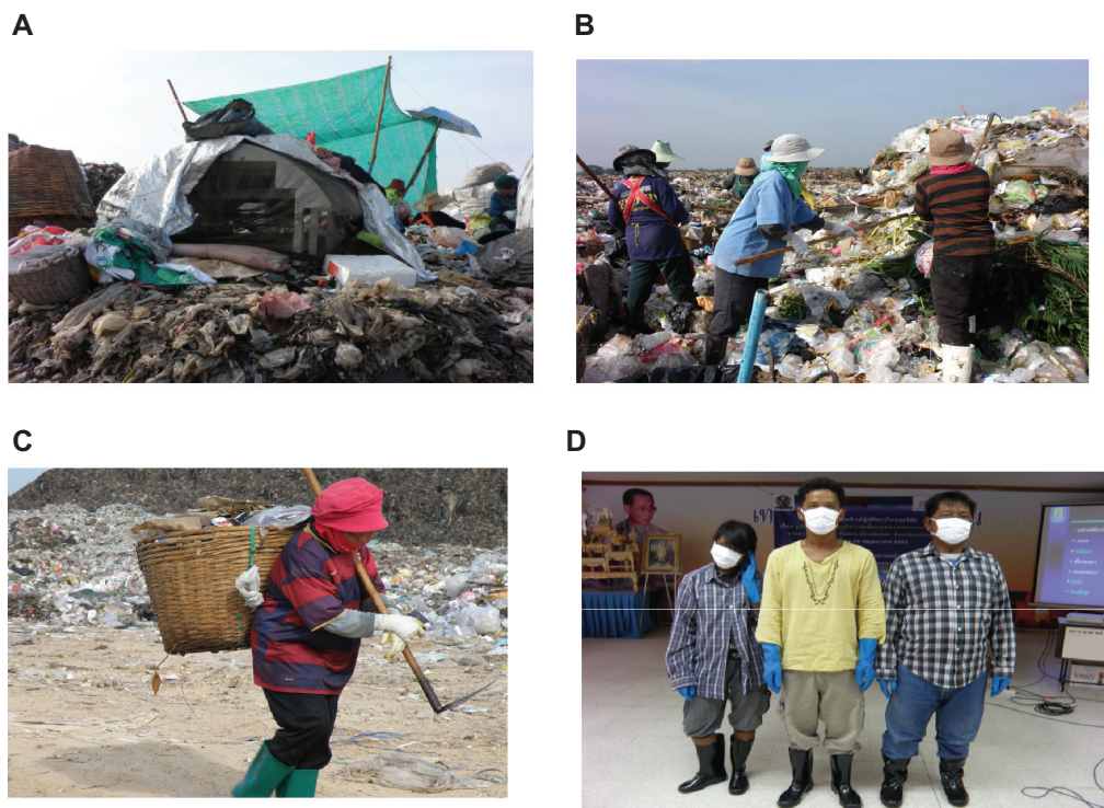
Figure 2 (A) Temporary shelter at a dump site. (B) Routine work activities. (C) Routine work: carrying a load. (D) Personal protective equipment demonstration on training day.

Only 23% of scavengers had received health information from the municipality.