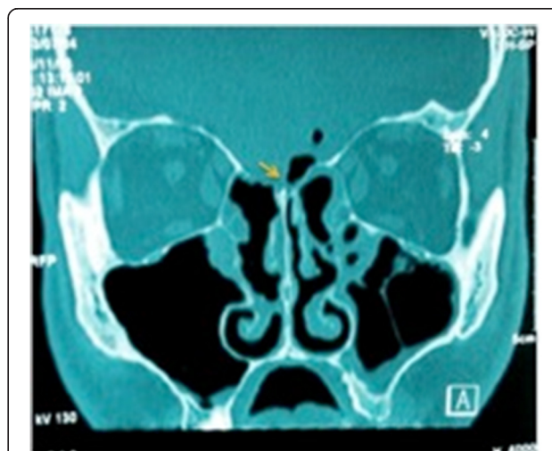
Figure 1 Postoperative pneumocephalus following FESS.

Coronal CT scan demonstrates a minimal amount of pneumocephalus (Yellow arrow) and defect in the left ethmoid roof adjacent to the middle turbinate insertion following FESS.