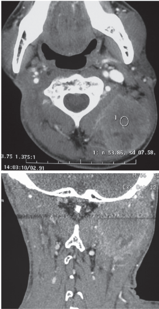
Figure 1. CT scan showing a large recurrent enhancing mass in the left neck of a patient with NPC following initial radiochemotherapy. CT, computed tomography; NPC, nasopharyngeal carcinoma.

and according to the TNM staging criteria (AJCC 2002) (10).