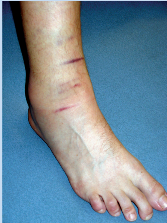
Figure 1. An acute ankle injury including a tibiofibular syndesmosis sprain. Note the edema and ecchymosis in the region of the distal tibiofibular syndesmosis and extending up the leg. Acute tenderness to palpation was present over the syndesmosis, and it extended approximately 6 in. (15 cm) superiorly over the interosseous membrane.

The patient's report of the injury, description of symptoms, and presentation usually provide a high suspicion of syndesmotomic ankle sprain. Most are unable to ambulate after injury without