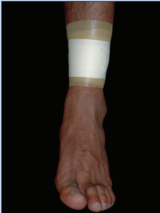
Figure 2. Taping used in the syndesmosis stabilization test. 64 Patients perform heel raises, walking, running, and vertical hopping (if possible) before and after 1.5-in. (3.8-cm) athletic tape is circumferentially applied over the tibiofibular syndesmosis to provide joint stability. The test result is positive if the patient's complaints of pain and/or instability in the region of the distal syndesmosis are relieved with the taping.

other lesions, including anterior talofibular ligament sprains, bone bruises, and osteochondral lesions. To date, there are no reports that have assessed the association between the extent of lesions on imaging and clinical presentation or long-term outcomes. Hence, it is unclear if MRI findings are prognostic of recovery time and outcomes. Research defining the clinical significance of imaging results is required before conclusions can be drawn on whether routine MRI is cost-beneficial in the management of syndesmotic ankle sprains.