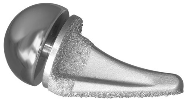
Fig. 1 A photograph shows the BioPro ® Modular Thumb.

This report describes our results using this implant design. Our aims were to (1) assess pain relief and functional improvement and preservation of the appearance of the thumb as reflected by improved Buck-Gramcko scores [5]. (2) We also wished to radiographically assess the prosthetic reconstruction during followup and (3) document what complications occur with the use of this