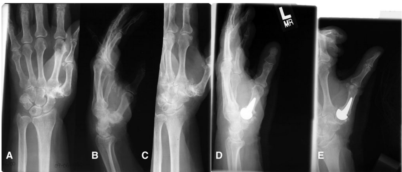
Fig. 2A–E Preoperative (A) posteroanterior, (B) lateral, and (C) oblique radiographs show the left hand and wrist of a 63-year-old woman with Eaton-Littler Stage III arthritis of the basal joint of the

thumb. (D) Lateral and (E) posteroanterior radiographs show the left hand and wrist 72 months after implant arthroplasty of the left thumb basal joint.