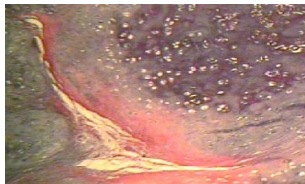
Figure 1. The lobulation pattern and fibrous tissue formation in enchondroma; the lobules are regular and the fibrous tissue is mature with low cellularity.

sections of all the samples were examined again. Two histologic patterns including tumor lobulation and fibrous tissue production around the lesions were used for making a distinction between well-differentiated chondrosarcoma and enchondroma. According to the histopathologic definition of the tumor, lobulation of enchondroma is regular and the lobules are the same size but well-differentiated chondrosarcoma is composed of different sizes of irregular lobules. Fibrous tissue formation around the tumor is the second most important pattern. The fibrous tissue around enchondroma consists of hyalinized mature connective tissue with few cellularity and little blood vessels. The tumor cells are inactive. In well-differentiated chondrosarcoma, the fibrous tissue around the tumor is cellular with active blasts and many blood vessels. 1-2 Figures 1 and 2 show the histopathologic pattern of lobulation and fibrous tissue formation in enchondroma and well-differentiated chondrosarcoma, respectively. Method efficacy was evaluated by tumor recurrence in a