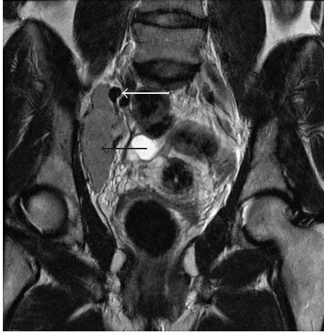
FIGURE 1: Pelvic magnetic resonance imaging: coronal T2-weighted imaging shows a well-capsulated, hyperintense, solid mass (black arrow), next to the iliac vessels (white arrow).