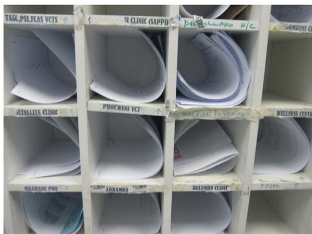
Figure 2. A cupboard where completed lab results are placed while they are waiting to be picked up by staff from clinics. doi:10.1371/journal.pone.0044462.g002

Based on the information obtained during this visit, and the discussions with the local health staff in Swaziland, a decision was