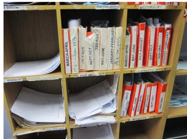
Figure 3. An archive for test results that were not picked up on time by staff members from the remote clinic. doi:10.1371/journal.pone.0044462.g003

made to go forward with an electronic system. This system, LabPush, would allow for communicating laboratory results electronically to the clinics. Although this would not reduce the amount of time it takes for blood samples to arrive at the laboratory, it would at least have the potential to reduce the amount of time it takes for the clinics to receive the results of the analysis once they are ready.