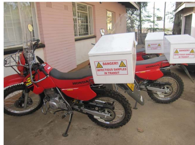
Figure 1. Motor bikes used to transport blood drawn from clinics to the central laboratory.

This paper presents a system called LabPush that has been implemented to reduce the TAT for clinics to receive reports from the lab once they are ready. The system supports sending SMS summaries of lab reports to mobile phones provided to the head nurse at remote clinics. The intent is that this will improve TAT by delivering these reports before motorbike transport can deliver them back to these clinics. This study thus adds knowledge regarding how ICT can be used to improve HIV treatment in developing countries by presenting a more rigorous scientific study of an SMS-based system designed to reduce TAT than has been reported. Although our results show that LabPush can improve