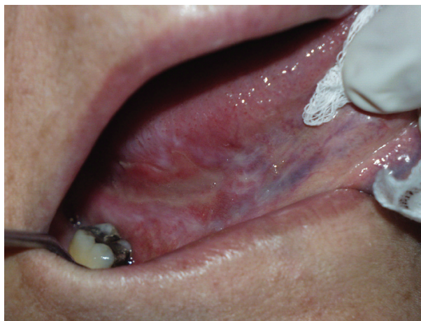
Fig. 2. Mucositis on tongue dorsum during HPCT.

sidered the possible dependence between mucositis and other factors that might exercise some influence in the appearance of symptoms, even though this was not a main study objective. Such factors included: treatment received prior to the transplantation procedure, the transplant itself, the source of hematopoietic progenitor cells, the administration of myeloid growth factors and patient age. Transplant type was not found to influence the grade of severity or duration of mucositis suffered. Relating patient age with mucositis grade and its duration, a statistically significant relation was found (ANOVA p < 0.005 ). The patient group with the youngest average age showed higher mucositis grades and longer duration. The progenitor cell source factor was not seen