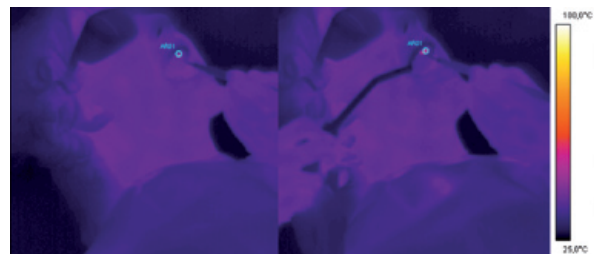
Fig. 1. Thermal camera images of an intervention on a retained canine tooth, before (left) and during (right) the surgery.