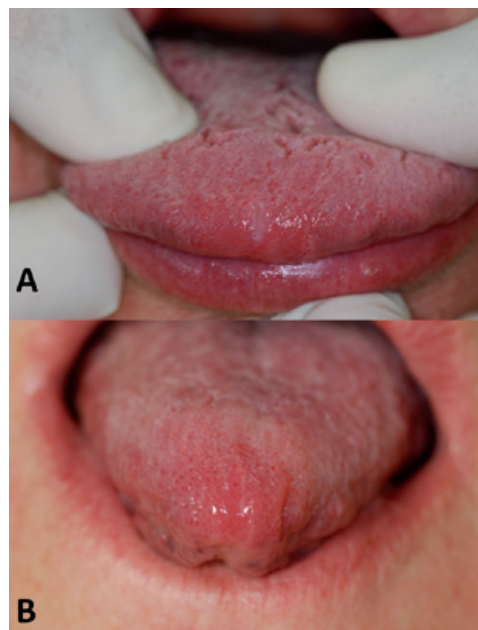
Fig. 3. Healing 1 week after surgery (A) and complete healing 2 weeks after surgery (B).