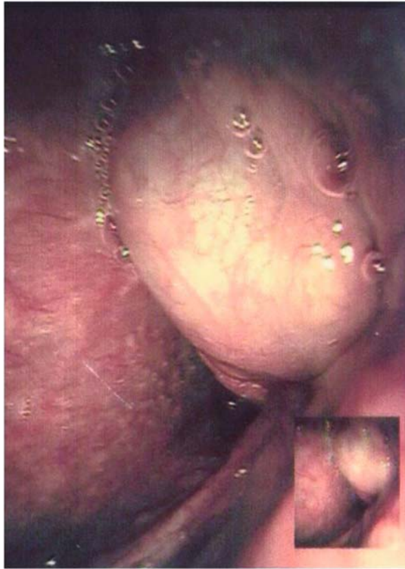
Fig. 1 Fibreoptic laryngoscopy showing a large globular swelling at the base of tongue and base of epiglottis