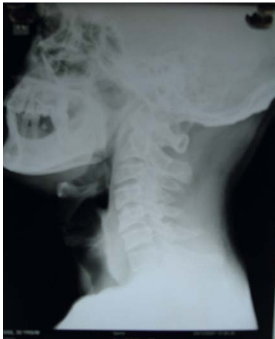
Fig. 2 X-ray neck lateral view- showing no space to pass Endotracheal tube