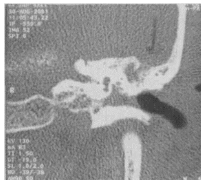
Fig II: CT cisternography showing defect in tegmen with opacity in mastoid air cells and middle ear.