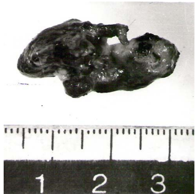
Fig. 3 Staghorn shaped rhinolith

It is necessary for the foreign material to evoke sup-puration following acute or chronic inflammation. Further requirements are precipitation of salts (mostly calcium and magnesium), obstruction and stagnation. The latter two prerequisites were underlined by Worgans [3] case, which may shed some light on the origin of endogenous rhinoliths. In a unilateral choanal atresia and subsequent infections, inflammations and fibrosis eventually produced a rhinolith, probably secondary to choanal atresia. Air currents, which probably help concentration and crystallization, are also needed. This was emphasized by Bowerman [4] who pointed out that maxillary calcified bodies (antroliths) are extremely rare although foreign bodies in the antra are not uncommon. Time seems to be an important factor it is not known how long is required for a foreign material to become encrusted, but most authors speculate in years. The symptoms at the time of lodgment are usually minor and are long forgotten by the patient. However, sooner or later most rhinoliths will make their presence known, although chance findings sometimes occur. The most frequent symptoms and signs after a latent period are unilateral nasal discharge (blood stained) obstruction and a feeling of blockage, epistaxis, slight to moderate swelling, headache, sinusitis, epiphora, and perforation of nasal.