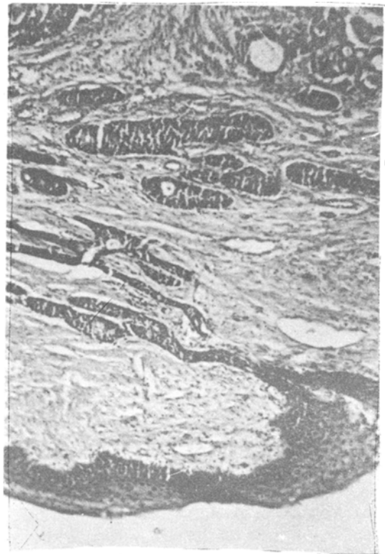
Fig. 3. Photograph of slide (x50) Shows neoplasm arising from surface squamous epithelium. Nests and trabeculae of cuboidal or oval cells with cystic spaces with centre of some of the cell groups. Stroma is desmoplastic.

Peripheral ameloblastoma is a tumour of the oral cavity, not involving bone, but exhibiting microscopic features of ameloblastoma. Most of the reported cases have