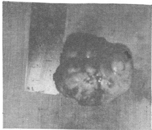
Fig. 1. Gross specimen

"Section from a tissue lined by squamous epithelium. Sub epithelial region showed a neoplasm composed of islands and groups of round / oval cells with small