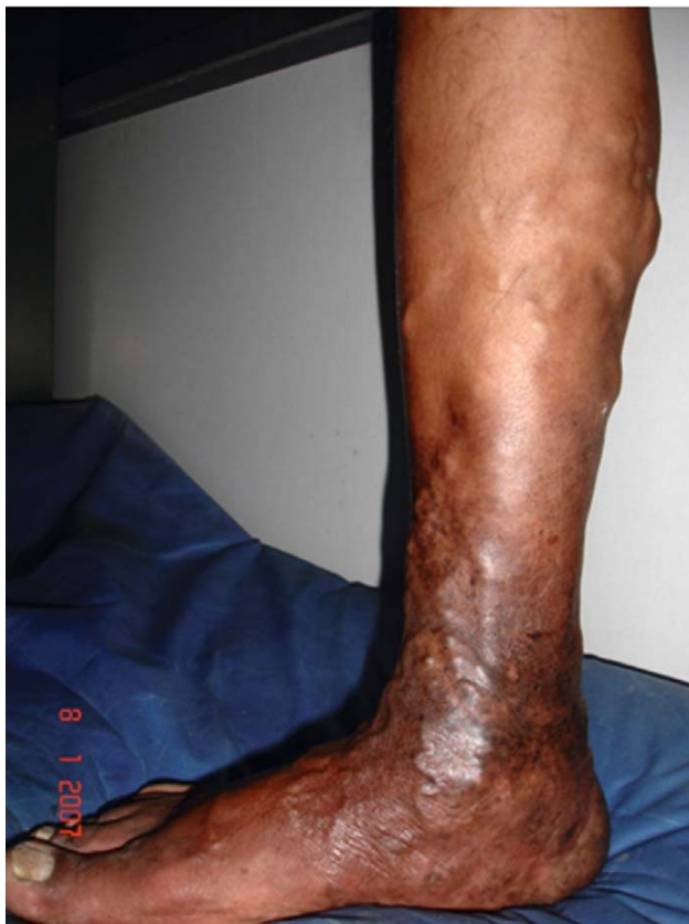
Fig. 1 Varicose veins with pigmentation and lipodermatosclerosis over lower 1/3 rd of leg

Only one patient presented with thrombophlebitis. He was managed conservatively with antibiotics, analgesics, leg elevation and crepe bandage. He was operated 15 days later for varicose veins.