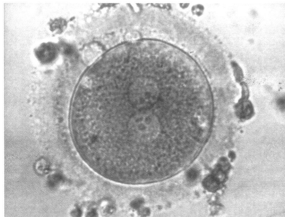
Fig. 1. A zygote with equal pronuclei.

Fixation of embryos and FISH analyses was performed between day 3 and day 5 postinsemination, as described previously by us (4). Briefly, the zona pellucida of the embryos was dissolved using acid Tyrode's (pH 2.4; Sigma Chemical Co., St. Louis, MO). Without separating the blastomeres, each embryo was held in an hypotonic solution of 0.5% sodium citrate in water (Sigma) until swelling of the blastomeres was observed, transferred to a glass slide with a minimal volume of hypotonic solution, and, finally, fixed by dripping a methanol/acetic acid (3:1) mixture until complete dissolution of the cytoplasm. FISH was performed utilizing direct chromosome enumerator probes (CEP; Vysis, Stuttgart, Fasanenhof, Germany) for chromosomes X, Y, and 18, and indirect \alpha satellite probes (Oncor, Gaithersburg, MD) for chromosomes 13 and 21. Whenever an abnormality was verified for