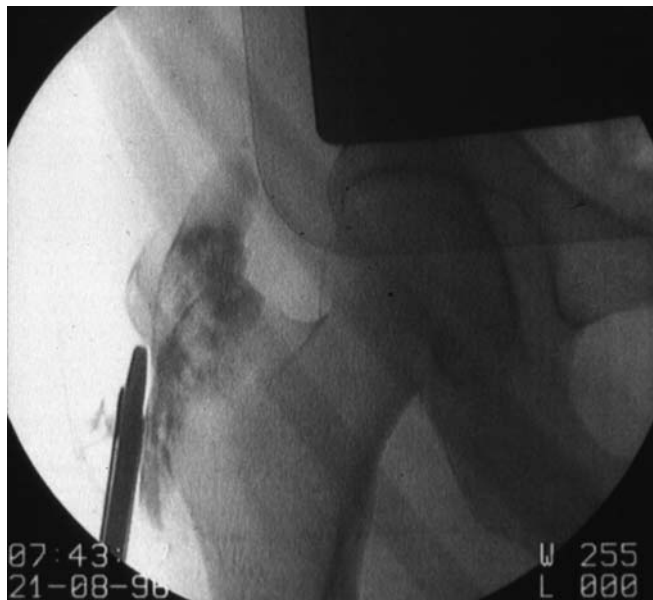
Fig. 1 Fluoroscopy after filling of the cavity with a radiopaque material and introducing a synovial resector into the bursa of the greater trochanter

The average time for surgery was 41 (25–56) min. Additional fixation of the iliotibial tract took another 18 (13–22) min. An amber-coloured exudation was found in the bursa of two patients. In two other cases, osteophytes of the trochanter were smoothed down by an acromionizer in order to avoid mechanical irritation and recurrent bursitis. During endoscopic bursectomy, haemorrhage had to be controlled using the electric cautery knife in eight cases. Pre-operatively, an average JOA score of 40.5 points was recorded. At a medium follow up of 25 (12–48)