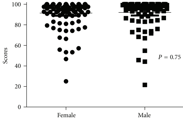
FIGURE 1: The TESS by gender (all patients).