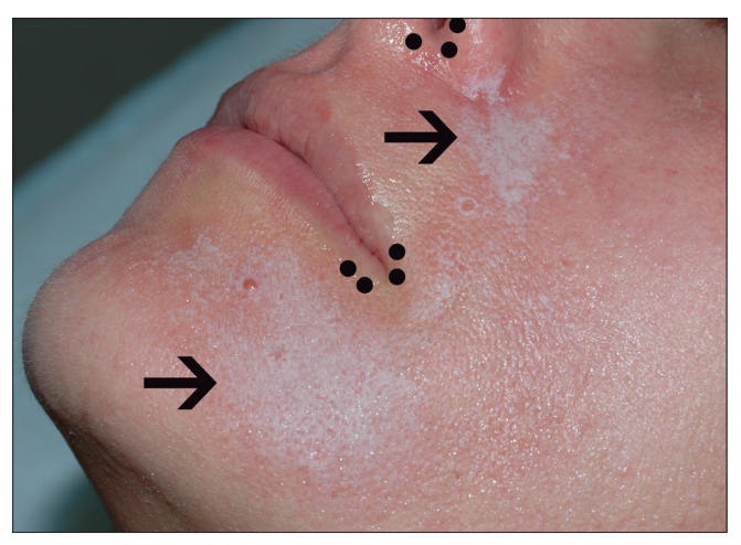
Figure 7: White frost after a combination of Jessner's and TCA 20% chemical peel of the face (arrows). Sparing of the lip corners and nasal opening (small dots) is evident due to the use of a petrolatum barrier protection during peeling

Dyspigmentation such as hypopigmentation or hyperpigmentation can occur following a peel of any depth and is more likely to occur in patients of Fitzpatrick skin types IV–VI. Hyperpigmentation is often temporary and results from post-inflammatory changes, but the