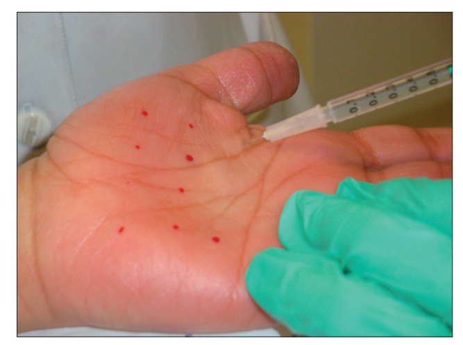
Figure 2: Injection pattern for palmar hyperhidrosis injection. Roughly 20 injection points spaced 1 cm apart should equate to 50 U of BoNTA-ONA (4 ml bacteriostatic water into a 100 U vial; 0.1 ml = 2.5 U) to each palm