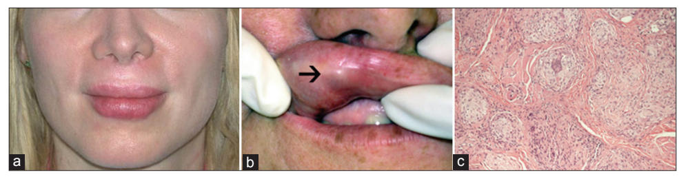
Figure 4: (a) Erythematous indurated papules on the outer and (b) inner lip weeks after HA filler injection (Restylane). (c) Histology demonstrated aggregates of non-caseating granulomas