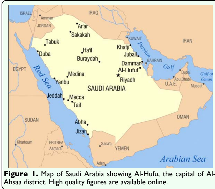
Figure 1. Map of Saudi Arabia showing Al-Hufu, the capital of Al-Ahsaa district. High quality figures are available online.