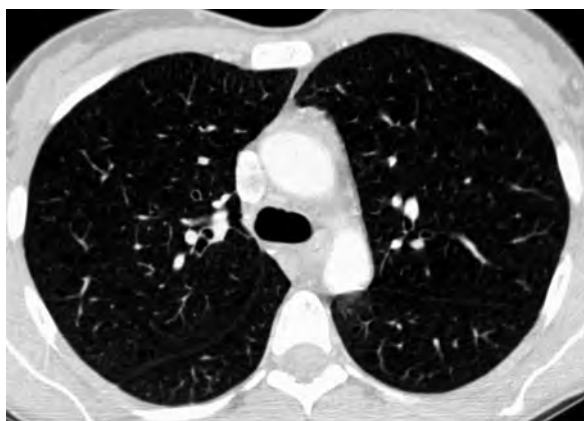
FIGURE 2: HIGH RESOLUTION COMPUTED TOMOGRAPHY OF THE LUNG SHOWING 5 TO 7 mm BILATERAL CYSTS