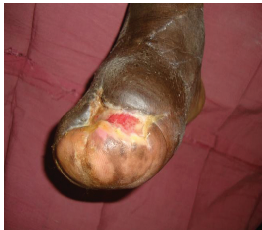
Fig. 4. Surgical example of wound healing with local flap closure.

patient's lower extremity vascular and neurological status is necessary before any surgical intervention (19, 20). Surgical treatment in our study group included sequestrectomy and debridement of necrotic and friable bone to healthy bone margins. In some cases, more extensive surgical debridement in the form of partial resection of the metatarsal bone or even phalangeal bones was performed. Surgical excision of the infected bone provided reliable specimens for microbiological and histopathological analysis. Minor amputations were performed if there was an extensive localized soft tissue necrosis provided that there was no critical ischemia.