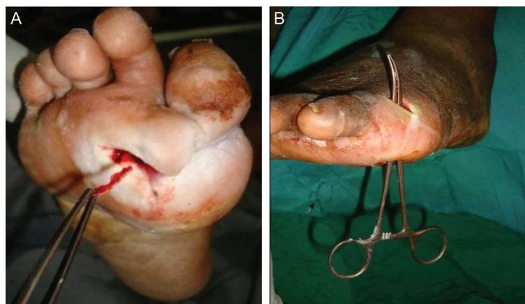
Fig. 1. Clinical pictures (A, B) demonstrating the probe-to-bone test in our study.

At initial presentation, 82.1% ( n = 271) of the osteomyelitis patients in the study group had an ulcer penetrating the bone or joint level (Wagner Grade 3 ulcer). The most common causative organisms for the study group were Staphylococcus aureus (33.3%), Pseudomonas aeruginosa (32.2%), and Escherichia coli (22.2%). In the remaining 59 patients from the