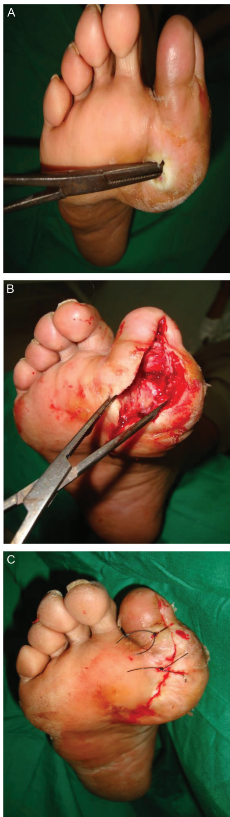
Fig. 3. Intraoperative clinical pictures demonstrating the surgical probing to bone (A), partial bone resection (B), and wound closure (C).