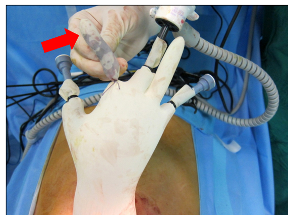
Fig. 1. To make the glove port, three 5-mm trocars were attached to the digits of a small surgical glove. After appendectomy, the resected appendix was put inside one of the digits (red arrow).